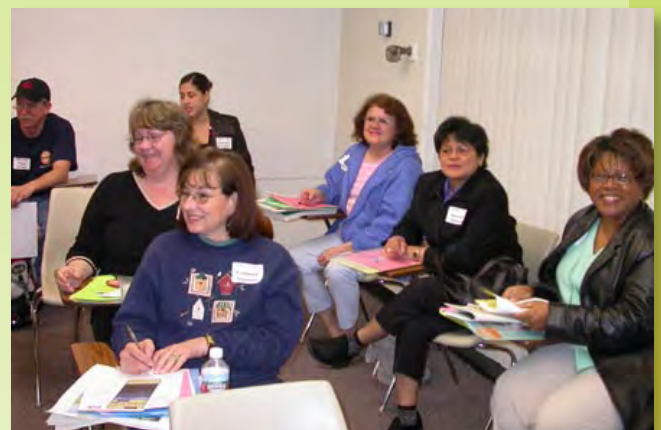
Participants are shown enjoying an interactive workshop from JobLinks 2005.