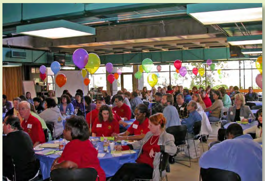
Providing a wonderful opportunity to network and meet co-workers face-to-face, JobLinks strengthens the comrade of classified staff and allows for professional growth opportunities.